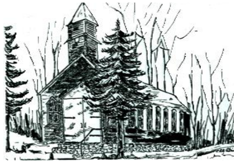
Raquette Lake, New York